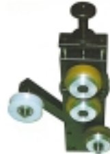
Brake tension unit for fibre carrier material