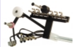
Overhead take off unit for fibre carrier material