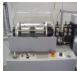
Machine model 2B with winding head for 2 wire spools