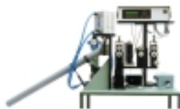
Detection cutter for extruded cables