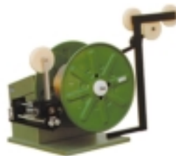
Motorized take up unit AAU-P with auto speed control