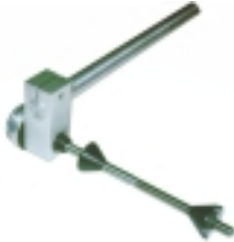
Standard take off unit for carrier material