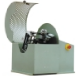
Detwisting unit with take up and traverse device