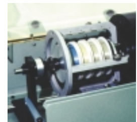
Machine with Winding head for 4 wire spool