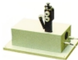
Separate transport machine