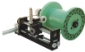
Take up unit with traverse device