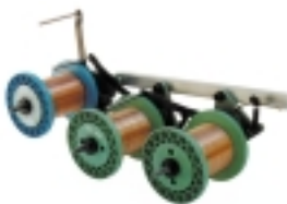
Take off unit for copper insertion wire and insertion device